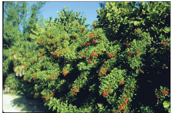
Figure 3. Brazilian pepper tree ( Schinus terebinthifolia ) was introduced to Florida in the 1840s as a cultivated ornamental. It is an extremely invasive plant that invades fallow farmland, pinelands, and hardwood hammocks of south and central Florida, and mangrove forests as far north as Levy and Duval Counties. It is listed as a noxious weed by FDACS.