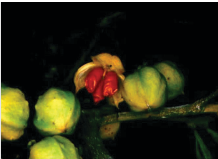
Figure 10. Carrotwood ( Cupaniopsis anacardioides ) is a popular landscape tree throughout southern Florida. It produces large crops of seed, which are eaten and transported by birds. It is now naturalized on spoil islands and in tropical hammocks, pinelands, mangrove swamps, cypress domes, scrub, and coastal strand communities. It is listed as a noxious weed by FDACS.