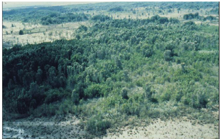
Figure 7. Melaleuca, or Australian paperbark ( Melaleuca quinquenervia ), once widely planted in Florida, now forms dense thickets and displaces native vegetation on 391,000 acres of wet pine flatwoods, sawgrass marshes, and cypress swamps in the southern part of the state. It is listed as a noxious weed by FDACS.