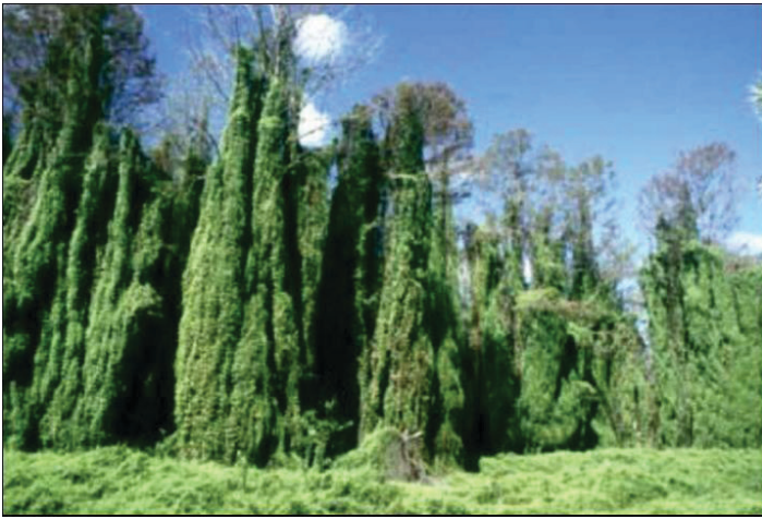
Figure 9. Old World climbing fern ( Lygodium microphyllum ) aggressively invades cypress swamps and tree islands in south Florida and carries both wildfires and prescribed burns through natural barriers. It is listed as a noxious weed by FDACS.