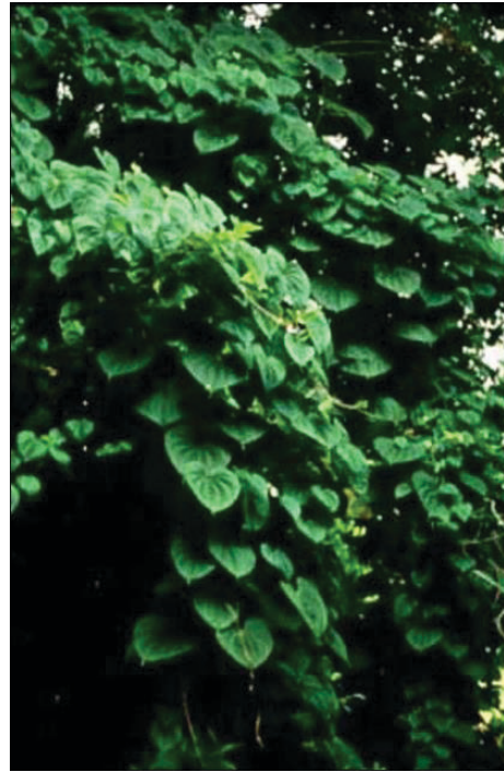
Figure 11. Air potato ( Dioscorea bulbifera ) can climb high into tree canopies and engulf surrounding vegetation. It is listed as a noxious weed by FDACS.

use of non-native plants species. Conclusions of the UF/IFAS Assessment for many species can be found at: https://assessment.ifas.ufl.edu/ . These conclusions can be used as guidelines by homeowners when selecting plants for landscaping.