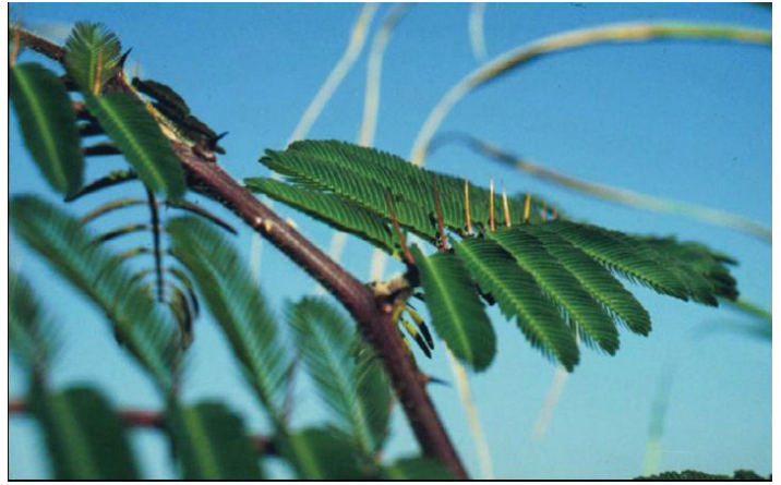
Figure 6. Catclaw mimosa ( Mimosa pigra ) is a sprawling, prickly shrub that was first identified in Florida in 1953 and now occurs on 1,000 acres of river floodplain, swamp forest, and lake margins in Broward, Palm Beach, Marin, St. Lucie, and Highlands counties. It is listed as a noxious weed by FDACS and USDA.