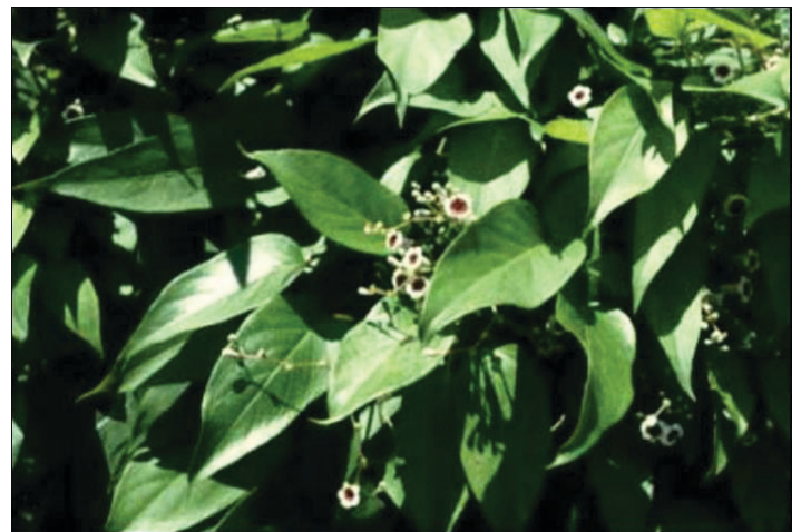
Figure 12. Skunk vine ( Paederia foetida ) invades native plant communities in Florida and can create dense canopies leading to the death of native vegetation. The plant emits a foul odor, especially when the leaves are crushed. It is listed as a noxious weed by FDACS.