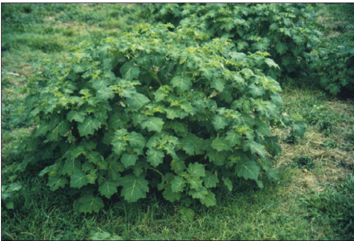
Figure 5. Tropical soda apple ( Solanum viarum ), first collected from Florida in 1988, is now a common weed on 500,000 acres of pastures, roadsides, ditchbanks, cultivated land, and natural areas. It is listed as a noxious weed by FDACS and USDA.