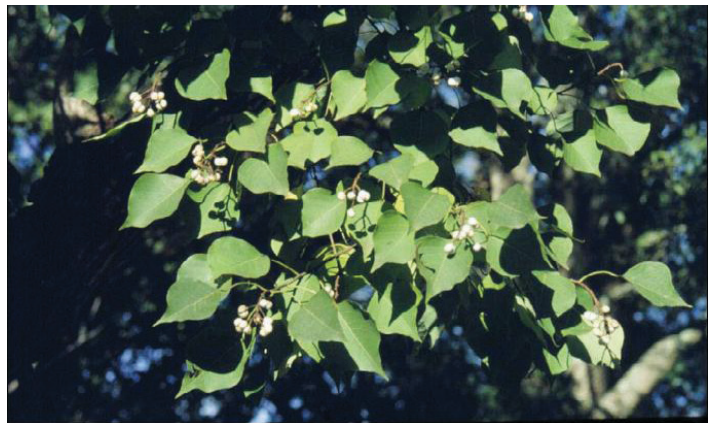
Figure 8. Chinese tallow ( Triadica sebidera ), sometimes called popcorn tree, has been considered an invasive pest plant in the Carolinas since the 1970s and is expanding its range on the US Gulf Coast through Florida. It is widely dispersed by birds and thrives in undisturbed areas such as closed canopy forests, bottomland hardwood forests, shores of water bodies, and sometimes on floating islands. It is listed as a noxious weed by FDACS.