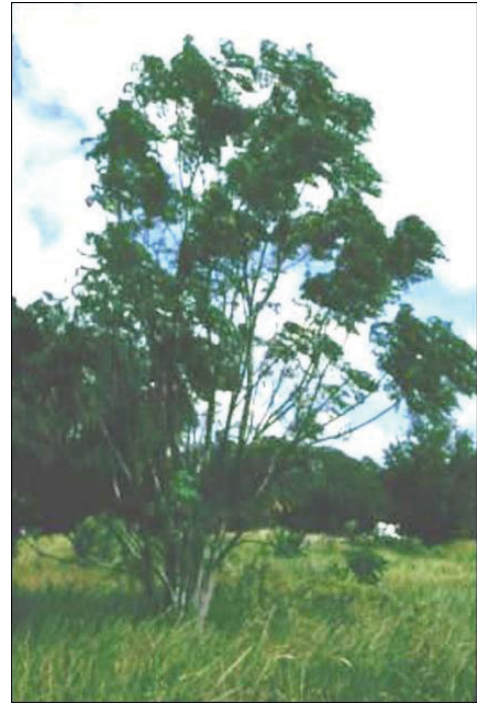
Figure 15. Chinaberry ( Melia azederach ) occurs primarily in disturbed areas such as rights-of-way and fencerows and has begun invading floodplain hammocks, marshes, and upland woods, particularly in north Florida. It is listed as FLEPPC Category I and its use has been discouraged by the FNGLA.