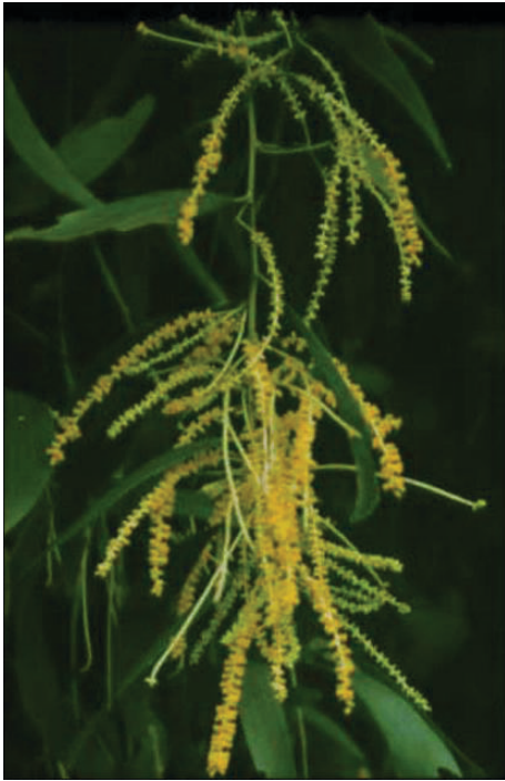
Figure 13. Earleaf acacia ( Acacia auriculiformis ), a messy tree in landscapes, invades disturbed areas as well as pinelands, scrub, hammocks, and pine rocklands in south Florida. It is listed as a FLEPPC Category I species.