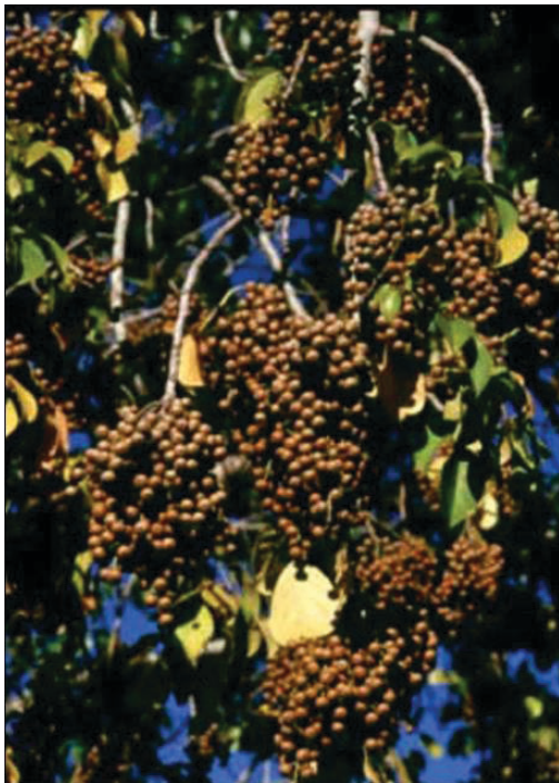
Figure 14. Bischofia ( Bischofia javanica ) is a weedy tree in landscapes. It is common in old fields and disturbed wetland sites and also invades intact cypress domes and tropical hardwood hammocks of south Florida. It is listed as FLEPPC Category I species and its use has been discouraged by the FNGLA.