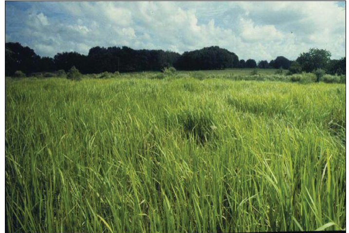
Figure 2. Cogongrass ( Imperata cylindrica ) has invaded many habitats such as sandhills, flatwoods, grasslands, swamps, river margins, and dry sand dunes throughout Florida and other southeastern states. It is listed as a noxious weed by FDACS and USDA.

communities in certain areas or throughout the state. Category II plants have the potential to disrupt native plant communities. While many plants on this list are also included on prohibited lists, the FISC list itself does not carry statutory authority. Examples of FISC Category I plants (in addition to the ones already listed as prohibited) include earleaf acacia ( Acacia auriculiformis , Figure 13), bischofia ( Bischofia javanica , Figure 14), and Chinaberry ( Melia azedarach , Figure 15). The FISC list is modified as merited by new observations. Current and past FISC Invasive Plant Lists are available on the FISC website ( Florida Invasive Species Council ).