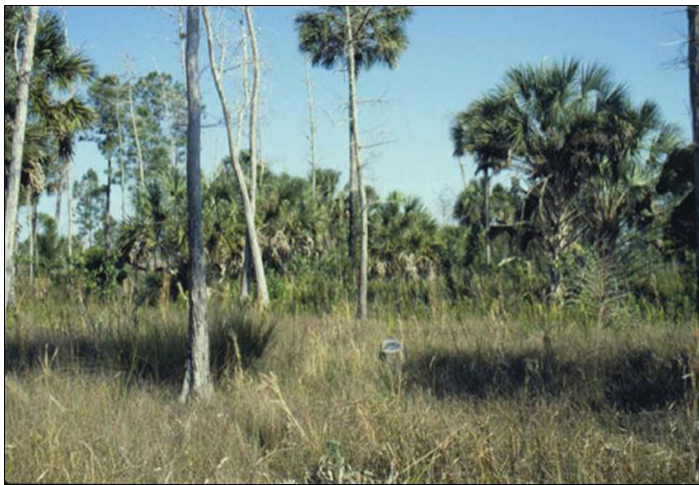
Figure 1. Designating certain lands to be managed (or restored) as natural areas is one method of protection for native plant and animal communities.

More than one-half of Florida's land area is in agricultural or urban land uses, and native habitats are continually being lost. Continued urbanization is an inevitable consequence of increasing population, and food production by agriculture is essential. However, preserving and protecting Florida's native habitats for historical significance and to protect native species, water quality, and water quantity is also essential. Natural areas have been designated on federal, state, county, city, and private lands (Figure 1).