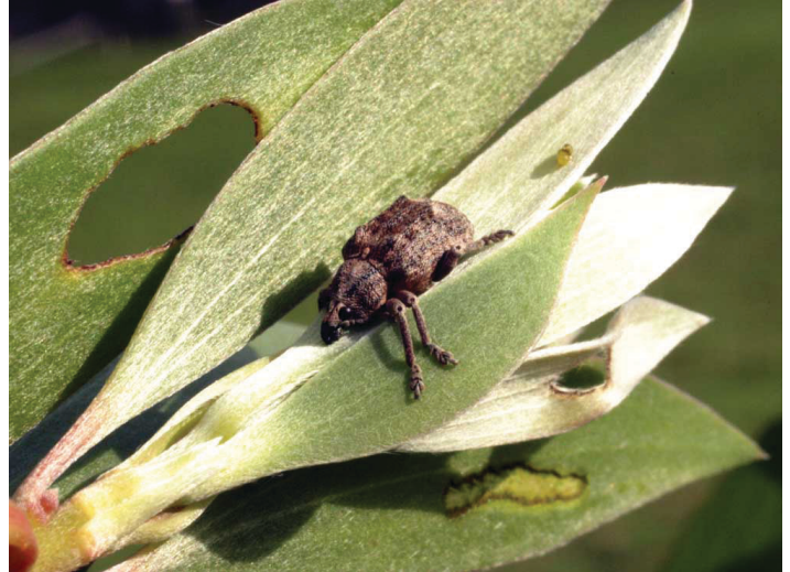
Figure 6. Melaleuca weevil ( Oxyops vitiosa ).

lobate lac scale should not be confused with biological control agents deliberately released to control melaleuca. This is an invasive insect native to India and Sri Lanka that was first found in Broward County in 1999. Evidence of the lac scale includes a dark, sooty mold covering leaves and high numbers of minute, bark-like bumps or scales on twigs. This insect is not only destructive to melaleuca but also to many ornamental plants and native vegetation. Information on how to control lac scale in the landscape can be obtained from your local UF/IFAS Extension office (to find your local office, visit https://sfyl.ifas.ufl.edu/find-your-local-office/ ).