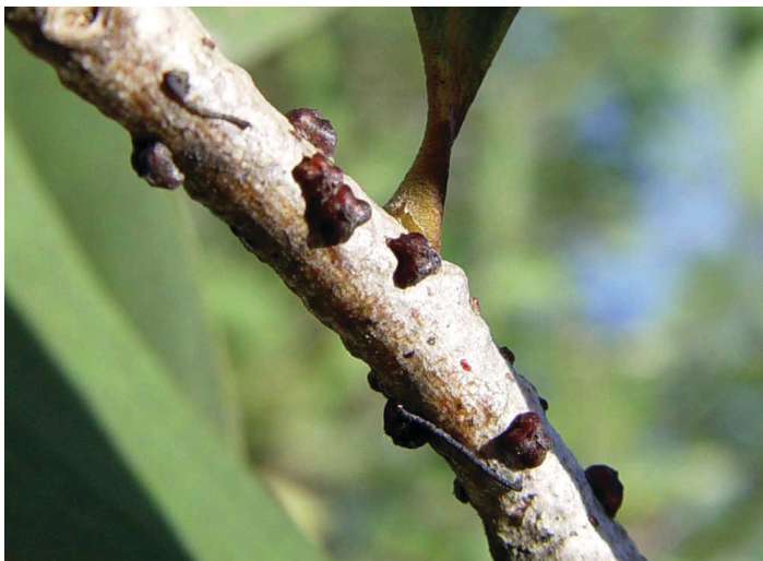
Figure 9. Lobate lac scale ( Paratachardina lobata lobata ) on melaleuca.