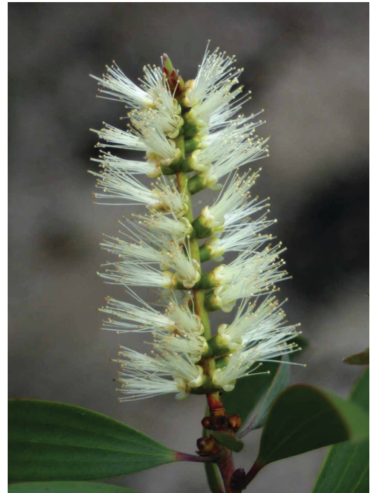
Figure 4. Melaleuca flowers are bottlebrush-shaped and creamy white; they grow up to 6 inches in length.