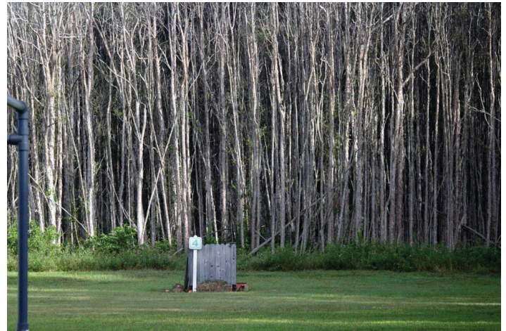
Figure 1. Infestation of melaleuca in Markham Park, Ft. Lauderdale, FL.

birds, which depend on native plants for seeds, fruits, and insects during migration. In addition, dense melaleuca stands can strongly restrict the use of parks and recreation areas, negatively impacting ecotourism in Florida.