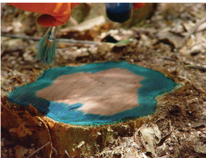
Figure 12. When applying herbicide to a cut stump, it need only be applied to the phloem and cambium (seen here after dye was added to the solution).