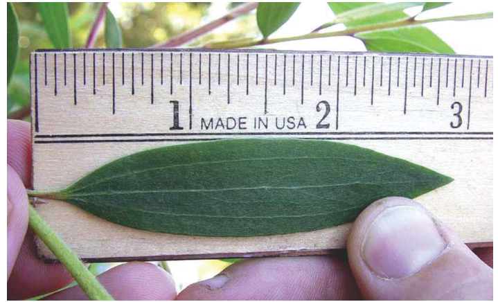
Figure 3. Melaleuca leaves are simple, alternate, narrowly lance-shaped and grow up to 4-inches long by \frac{3}{4} -inch wide. They are leathery with three prominent veins and emit a smell of camphor when crushed.