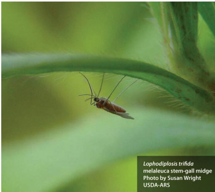
Lophodiplosis trifida melaleuca stem-gall midge