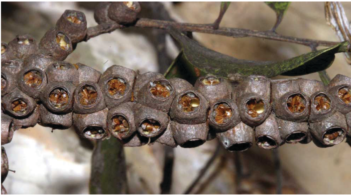
Figure 5. Melaleuca seed capsules are clustered on stems. Each capsule may hold 200 to 300 tiny seeds.