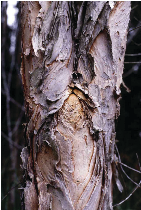
Figure 2. Melaleuca bark is thick, pale, papery-soft, and easily peels.