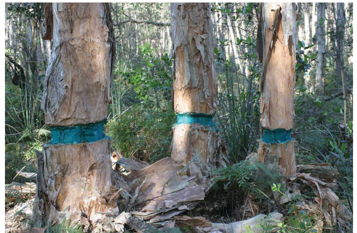
Figure 10. Herbicides applied to melaleuca using the “frill-and-girdle” technique. Application areas are dyed blue.

Individual trees can be killed by applying herbicide using a technique known as “frill-and-girdle” (Figure 10). Frill-and-girdle involves cutting away the tree’s thick bark and applying a herbicide mixture of imazapyr and glyphosate to the living portion of the trunk (cambium), just inside the bark and just outside of the wood (Figure 11). This technique leaves the trees standing and can be unsightly and potentially hazardous when trees decay and fall.